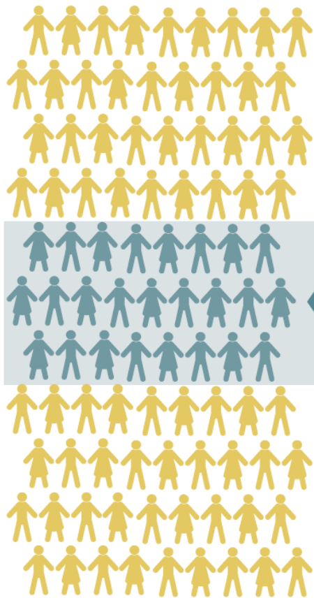
Researchers International / Swedish